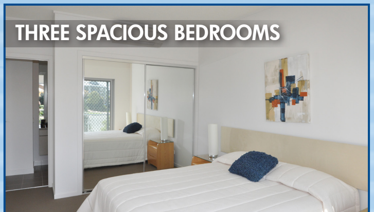
THREE SPACIOUS BEDROOMS