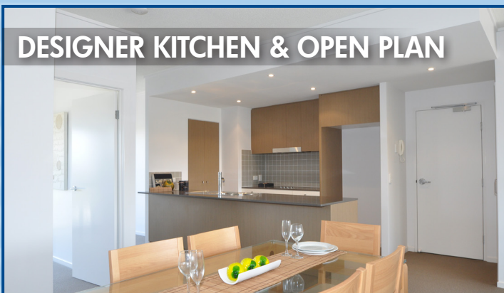
DESIGNER KITCHEN & OPEN PLAN

This new three level building features cutting edge urban architecture and is highly sought-after by owner occupiers and tenants alike, being close to a range of transport, shopping, education and health services.